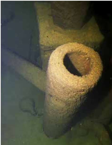
Intact pump with the handle behind the main mast.

The pumps were made of elm. They were bored out accurately through the heartwood, then tarred and served with canvas and rope to prevent leakages due to drying out. On the steering stand there were two pumps near the mizzenmast and one near the main mast 23 .