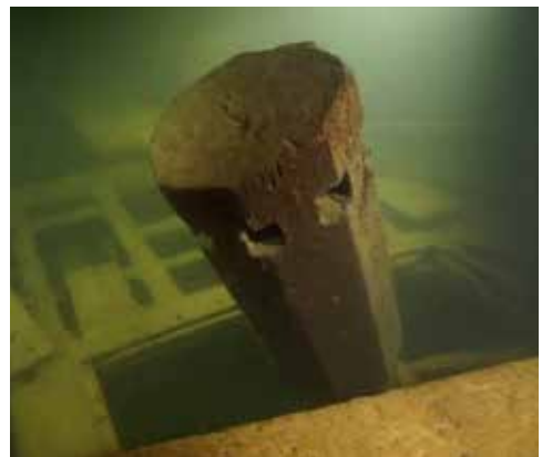
The upper part of the capstan behind the foremast with 8 holes. Video frame capture: Kari Hyttinen.

According to specifications for building Huis te Warmelo - large English capstan [spil, kaapstander] with 10 half holes, an upper English capstan with 8 half holes 20 .