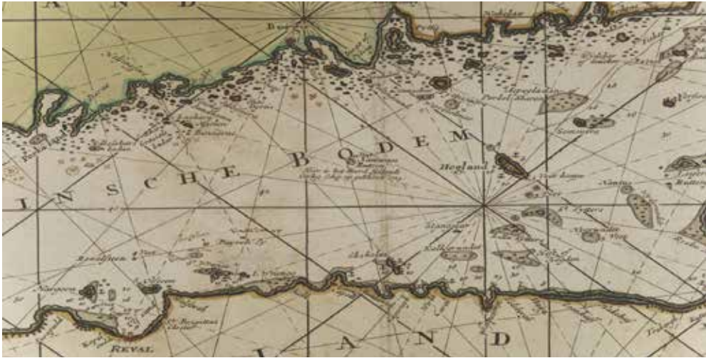
The location of the sunken man-of-war on the nautical chart about 1720 (S.0429(08)).

the Great's Baltic Sea fleet. Vyborg, Riga and Esperans, under vice-admiral C. Cruys, got stuck on Kalbådagrund on 22 nd of July 1713 while chasing three Swedish battleships Ösel, Estland and Verden under commodore Raab. The Riga and Esperans were got off, but the Vyborg had to be burned. The Vyborg had 50 cannons 14 . The wreck of Vyborg is known on the Kalbådagrund shallow and some of her cannons have been raised in 1960'ties. Because the Vyborg was burned by Russians when they were force to leave her on the shallow, the wreck is deteriorated.