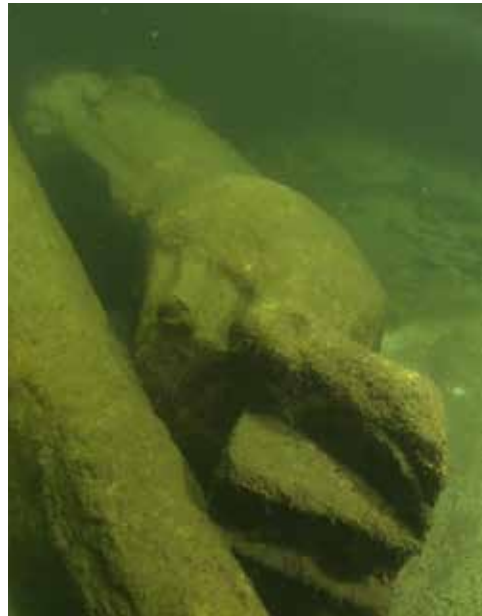
Figure head.

The aft castell has collapsed behind the stern and most of it and decorations are inside