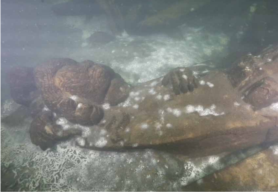
Stern statue.

the sediments. On the bottom behind the stern is visible one stern statue.