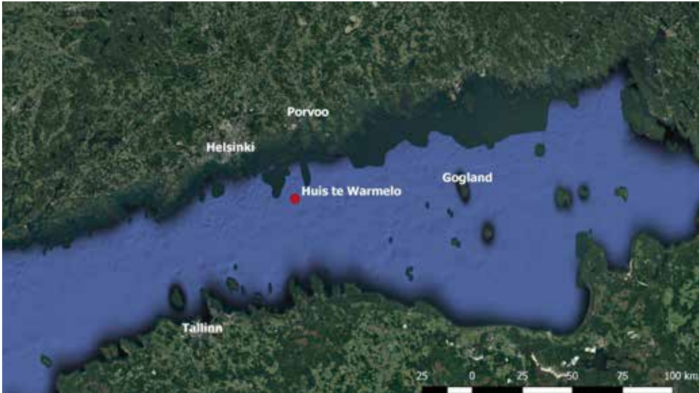
Location of wreck Huis te Warmelo.

the chief gunner. Half of the 200 crew members were either from Alkmaar or Medemblik 11 .