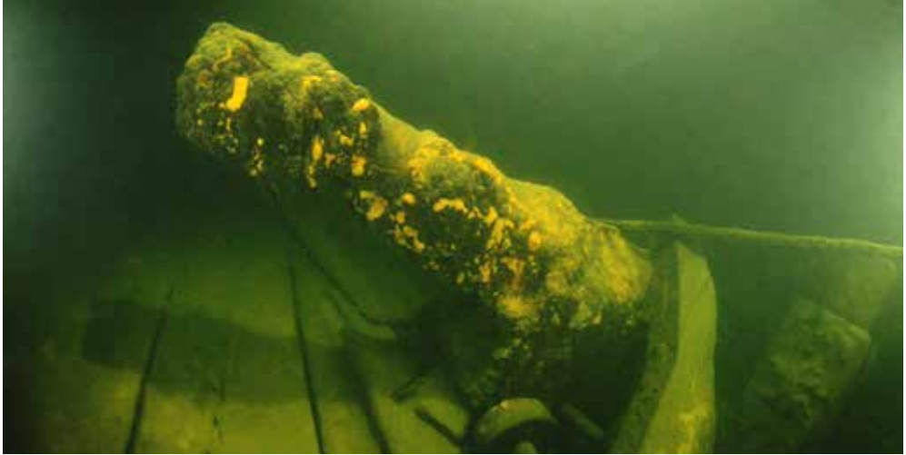
Cannon on the starboard side near the fore mast.

the keels. One clear structure, that is visible, is the wing transom. The tender specification gives the length for the wing transom 24.5 feet (6.94 m).